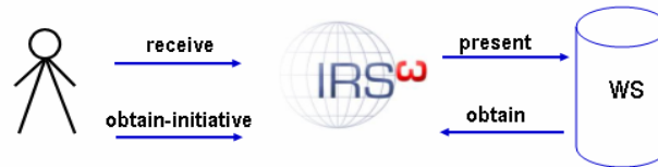
Fig. 1 A typical sequence of choreography events occurring during goal based web service invocation in IRS-III.

Figure 1 depicts the event sequence for this typical goal driven web service invocation scenario.