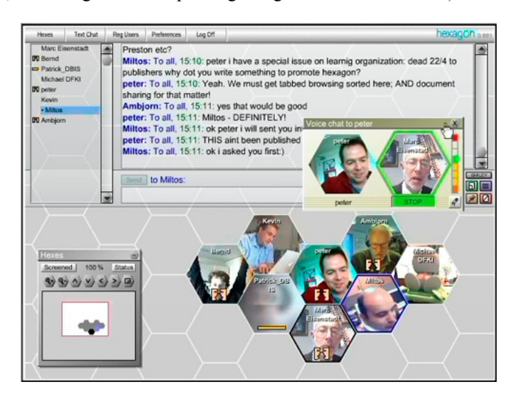
Fig. 3. A (Hexagon) grid of (8 participants)

In Fig. 3, a Hexagon room screenshot during this period, shows 8 participants at work in this community, communicating synchronously via private or group text chat, and audio chat, whilst participating in the concerted writing of the project proposal. The communication channels provided in Hexagon are used in different ways. While the video channel, which is continuously open, is used for group awareness, a piece of information relating to the overall proposal can be communicated via group chat, visible by everyone, and pairs of two can collaborate via audio chat. The Hexagon view displays two audio chats taking place at this time, one including users labeled Bernd and Ambjörn and the other one labeled Marc and Peter (with Marc's hexagon highlighted, indicating that he is speaking using audio at that moment).